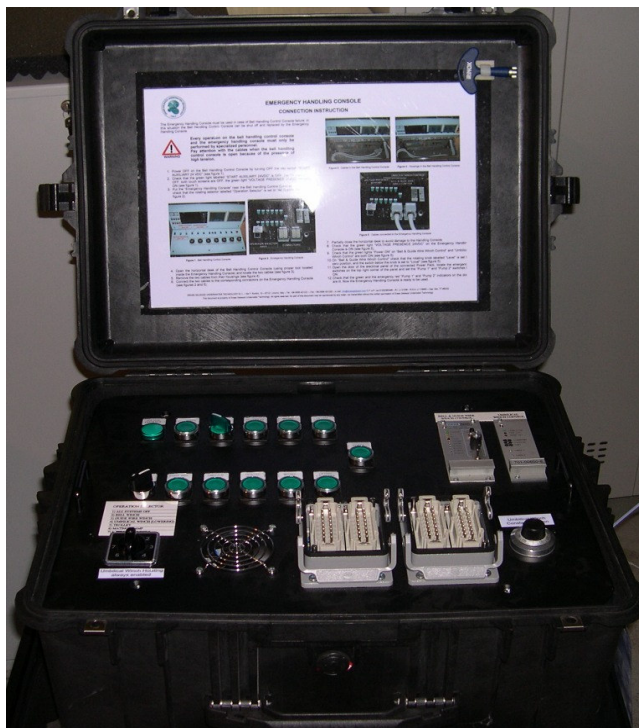
Picture 1. Portable Emergency Console